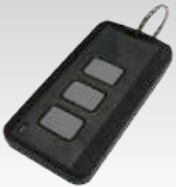
IDRC 433 K3