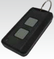
IDRC 433 K2