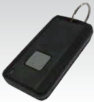
IDRC 433 K1