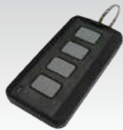
IDRC 433 K4